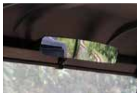
REARVIEW MIRROR (10001080)