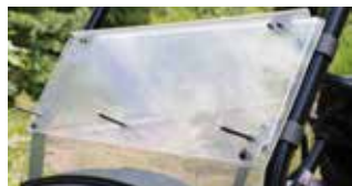
SPLIT WINDSHIELD (699872)

Here's how to customize your OX400 with our most popular trail riding essentials.