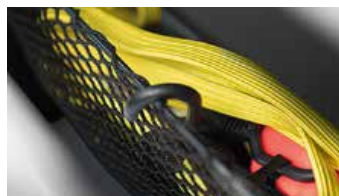
BED NET KIT (652838)