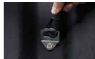
BED D-RING KIT (652349)